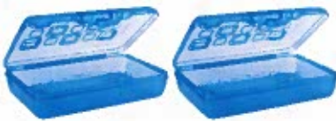
2 plastic flip lid pencil boxes