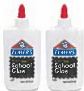
2 Elmer's Glue bottles