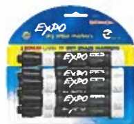
6 dry erase markers (black)