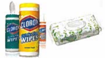
1 container of wipes (either disinfectant or baby wipes)