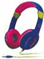
headphones (NOT earbuds)