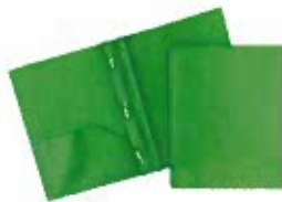
2 plastic pocket folders