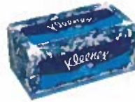
1 box of tissues